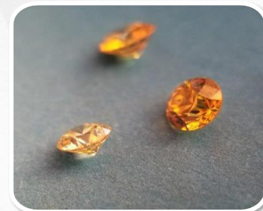
Fancy orangey-yellow & yellow diamonds from Q1-4