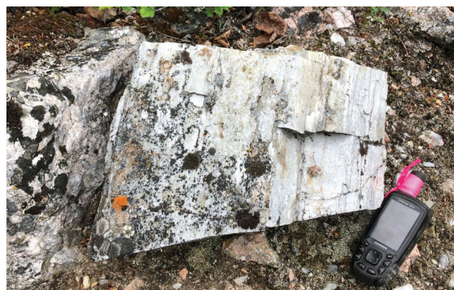
Large spodumene crystal from the Moose 2 pegmatite, June 2023