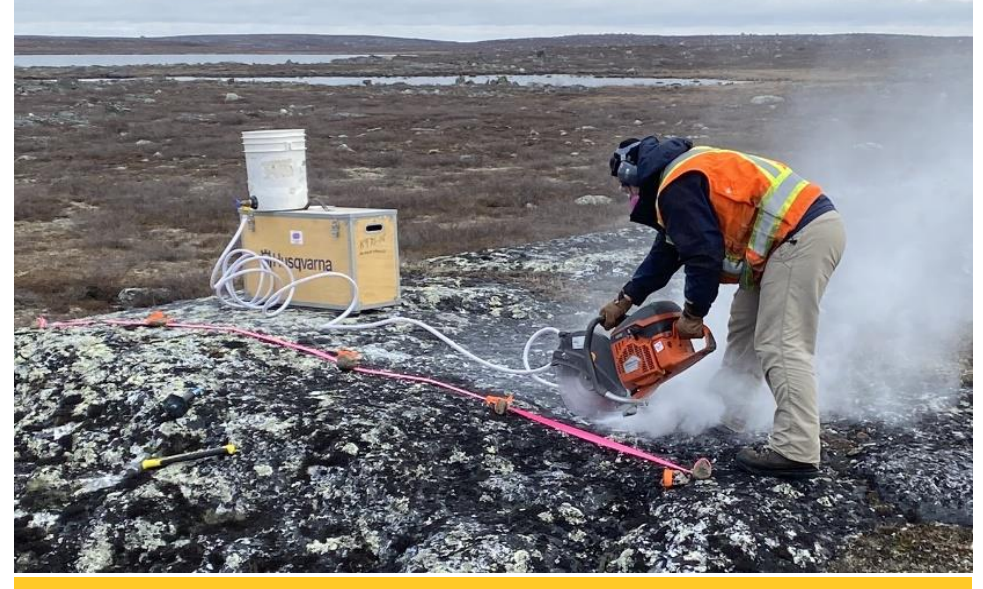
Image 2: Geologist Mike MacMorran cutting a channel sample on a portion of the newly discovered MK3 pegmatite, MacKay Project, NT

short period of time, and with limited field work, North Arrow has discovered four significant spodumene pegmatites within a newly recognized pegmatite field in the Northwest Territories. These discoveries are located in a similar geological setting to the better-known Yellowknife Pegmatite Province, and North Arrow's work to date demonstrates they have potential for similar size and scale to the pegmatites of the Yellowknife area. The LDG and MacKay spodumene pegmatites lie within several kilometres of the Tibbitt-Contwoyto winter road connecting Yellowknife with the NWT's diamond mines located just north of the properties. Exploration drilling in 2024 will benefit from use of this winter road, as well as North Arrow's fully permitted exploration camp which has been updated in support of this work."