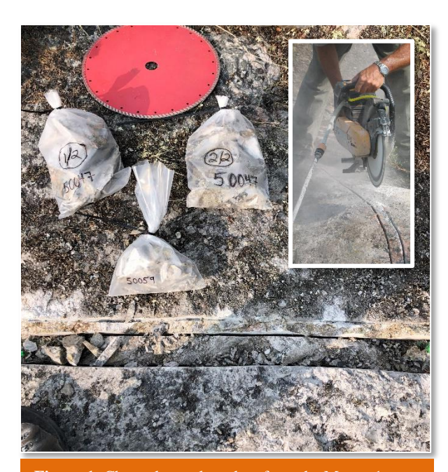
Figure 1 : Channel samples taken from the Moose 1 pegmatite. Inset: Rock saw at work cutting a channel for sampling at Moose 1 pegmatite. DeStaffany Project, June 2023 .

The majority of channel samples were collected from the Moose 1 pegmatite, which had seen limited historical evaluation. Moose 1 has been mapped in outcrop over a north-south strike length of approximately 350m. Fourteen channels (54 samples), ranging from 3m to 5m in length, were cut over an approximate 260m strike extent of the pegmatite. Assays confirm that spodumene mineralization is consistent over the southern two thirds of the